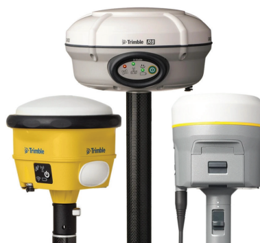
GNN Base & Rovers